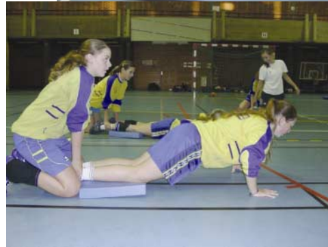
Fig 2 Example of a strength exercise (“Nordic hamstring lowers”). Top: start position; a partner holds around the player’s ankles. Bottom: The player falls slowly forwards, using hamstrings to resist the fall against the floor as long as possible

relative risk of the number of injured players according to the intention to treat principle to compare the risk of an injury in the intervention and control groups. Cox regression was our analysis tool for the primary outcome as well as the secondary outcomes, and we used the robust calculation method of the variance-covariance matrix, 16 taking into account the cluster randomisation. We tested rate ratios with Wald’s test. We used one way analysis of variance to estimate the intraclass correlation coefficient to obtain estimates of the inflation factor for comparison with planned sample size. We used the inverse of the difference between percentages of injured players in the two groups to calculate the number needed to treat to save one injury. We calculated exposures to training and matches and incidence of injury as described in our earlier study.