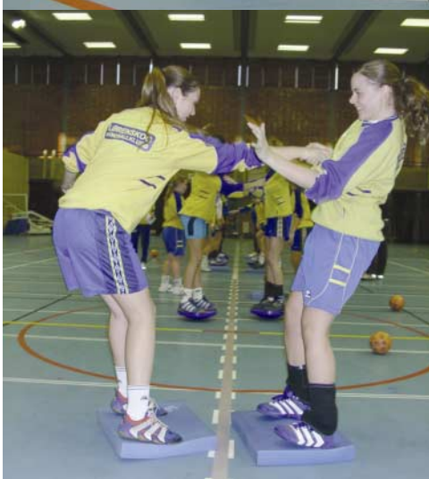
Fig 1 Top: mat exercise. Middle: wobble board exercise. Bottom: mat pair exercise