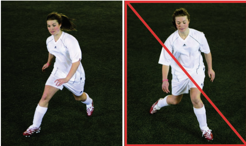
Fig 2 | Example of running exercise illustrating key objectives of all running, jumping, cutting, and landing exercises: core stability and correct lower extremity alignment. Left: correct technique; right: incorrect technique with pelvic tilt and knee valgus alignment to right

per club and a dropout rate of 15%, which means that we needed to include about 120 clubs with 2150 players.