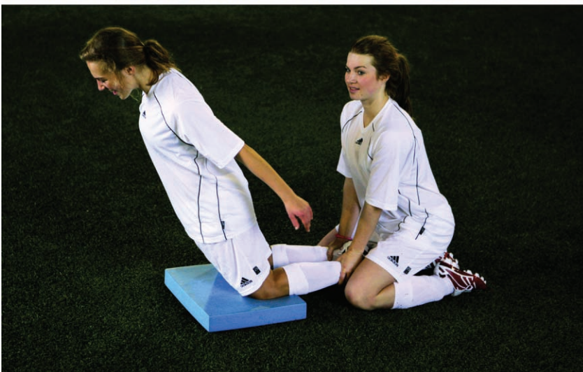
Fig 1 | Two examples of strength exercises. Top: side plank exercise. Bottom: the "Nordic hamstring lower"

Monica Orthopaedic and Sports Medicine Research Foundation, and the FIFA Medical Assessment and Research Centre, developed the warm-up programme. Before the start of the study one club tested the programme. It consisted of three parts (table 1). The initial part was running exercises at slow speed combined with active stretching and controlled contacts with a partner. The running course included six to ten pairs of cones (depending on the number of players) about five to six metres apart (length and width). The second part consisted of six different sets of exercises; these included strength (fig 1), balance, and jumping exercises, each with three levels of increasing difficulty. The final part was speed running combined with football specific movements with sudden changes in direction.